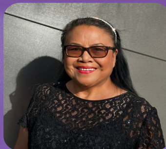
Featuring compositions by Lorna Katz